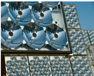
Example of one CPV technology implementation. This system, designed by SolFocus, utilizes reflective, non-imaging optics to concentrate light from the sun.